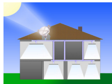
Example for the Sollektor on the roof